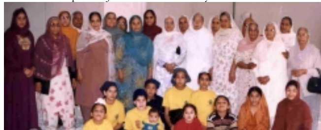
Scarborough Sukhmani Sahib Bibian sponsor the Guru's Foundation and children with $4000 donation